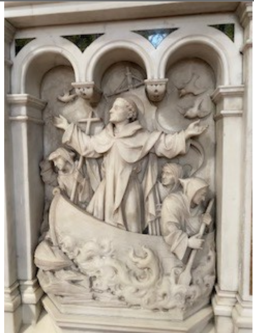
Detail of St Columba from our Pulpit

Mission Statement: St. Columba's parish is a vibrant and welcoming community of faith, continuing to give practical witness to the Good News of Christ, through worship and reflection, and through Christian service to the community.